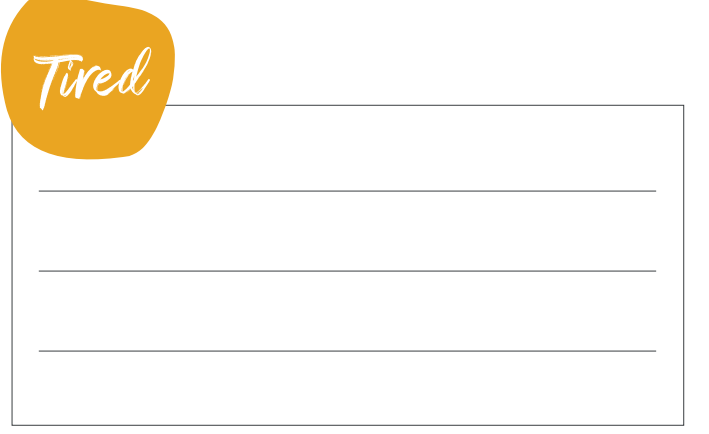
Ex, "It felt like someone kept taping my eyelids shut."

Ex, "I could brush my hair without getting tired!"